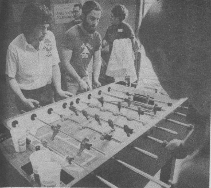
dies bent in competition, faces contorted with concentration, players in the lewide community college and university foosball tournament battled it out at the