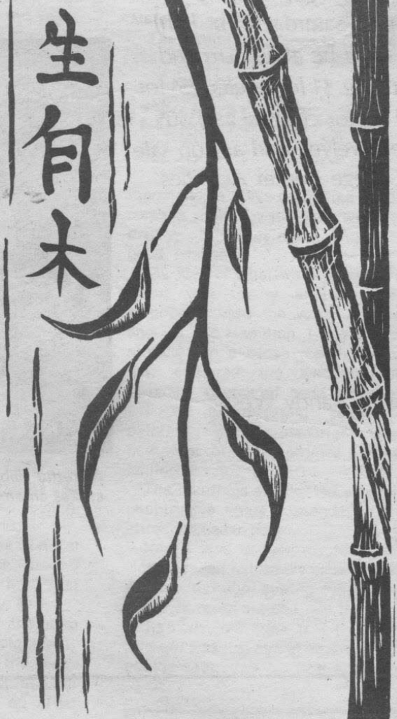
"Born From Wood"