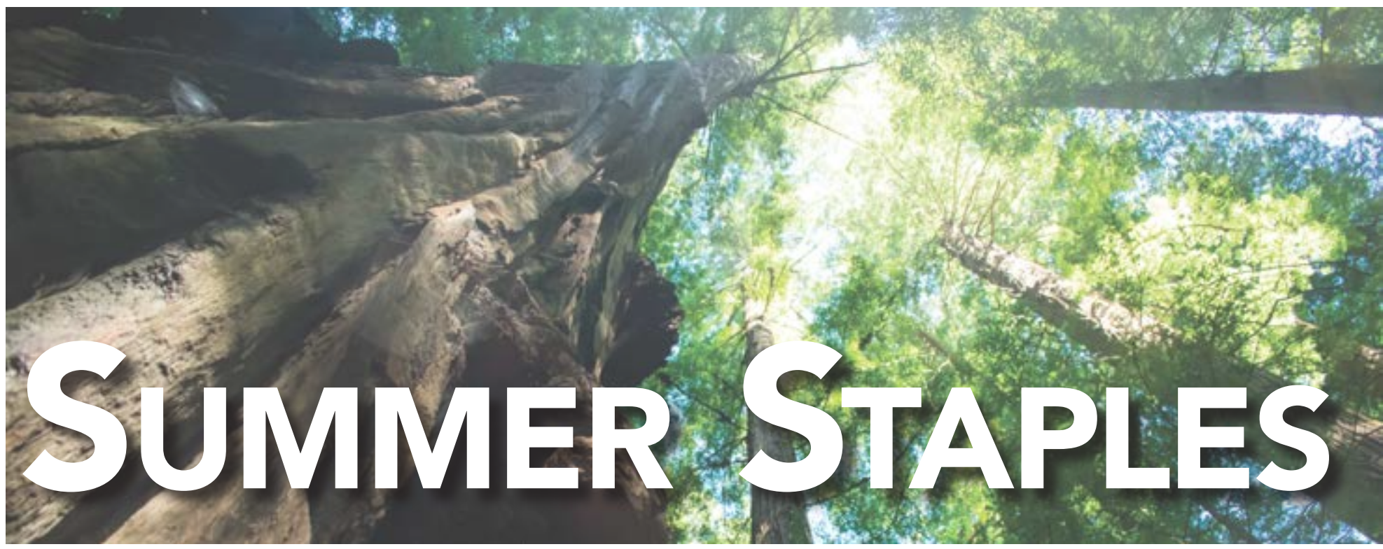
A few tips to make sure the rest of your summer is one to remember