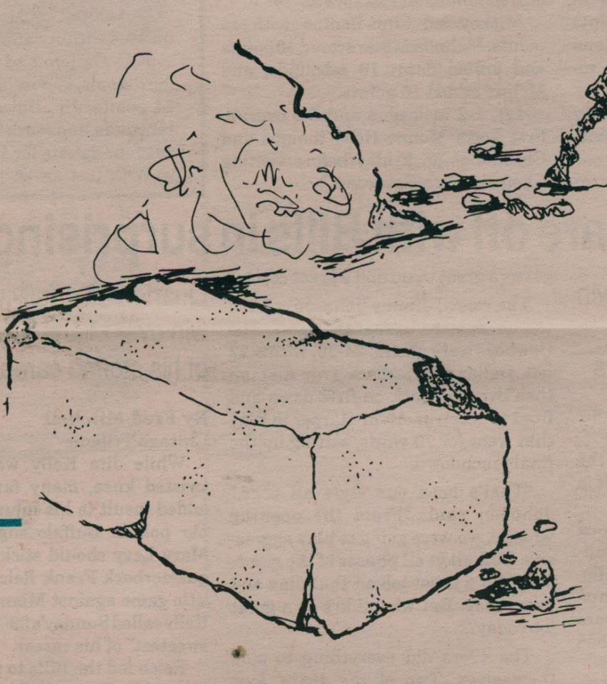
Illustration by Uriah P. Roth