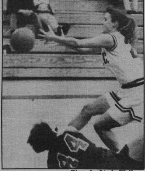
Fast break baskets key women Roadrunners' first league win.