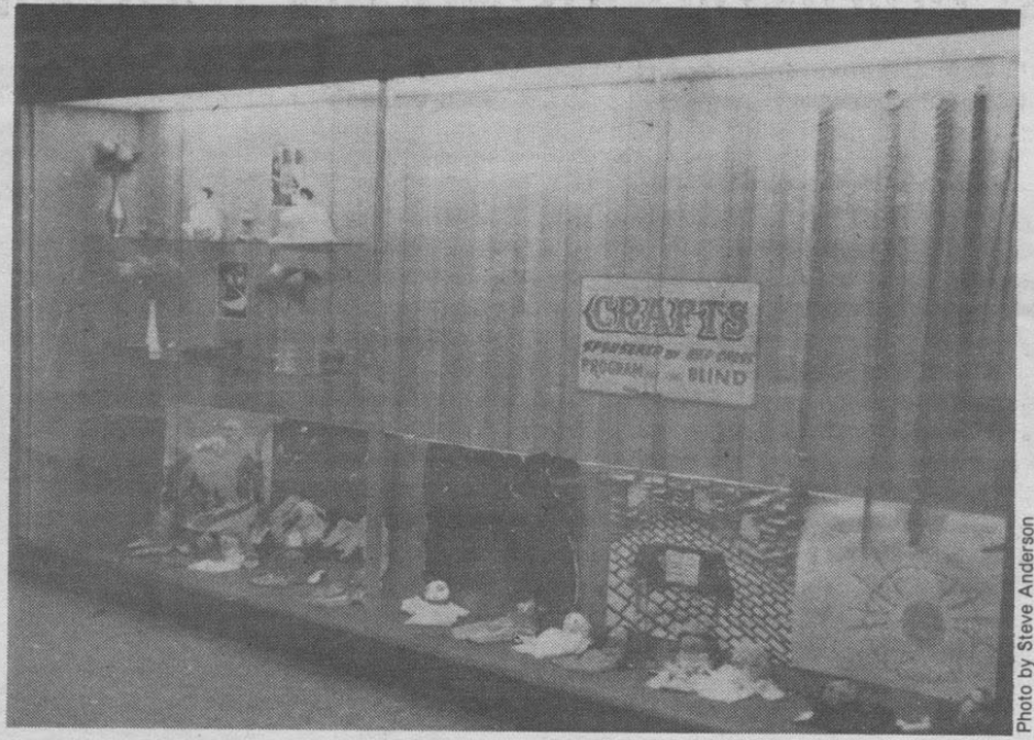
An exhibit of arts and crafts created by members of the "Crafts for the Blind" class will be on display in the LRC for the next ten days. Also included are phtographs of the class at work by LRC photographer Joan White.

The program is a joint effort of LBCC and the Albany chapter of the American Red Cross. The classes are held each Thursday from 10am to 2pm at the Red Cross office located at