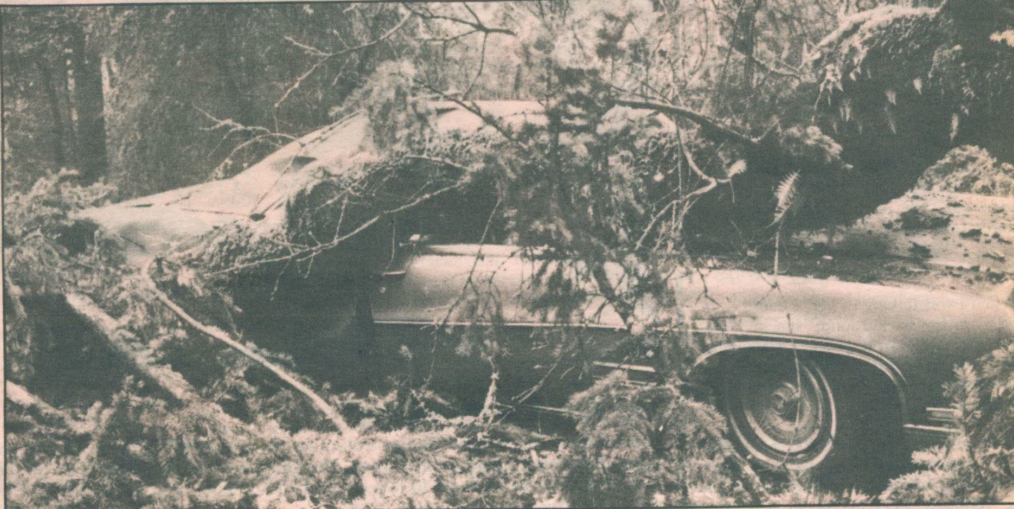
The Commuter/JESS REED