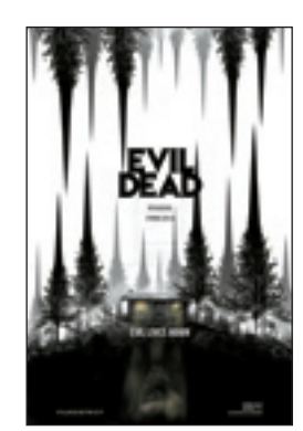
Evil Dead Rated: R Genre: Gore Remake