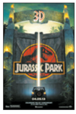
Jurassic Park Rated: PG-13 Genre: Dino Rerelease

Sources: IMDb, Yahoo! Movies, Fandango.com