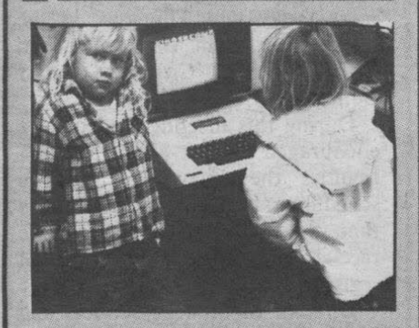
☐ Family Center serves both parents and kids, pg. 3