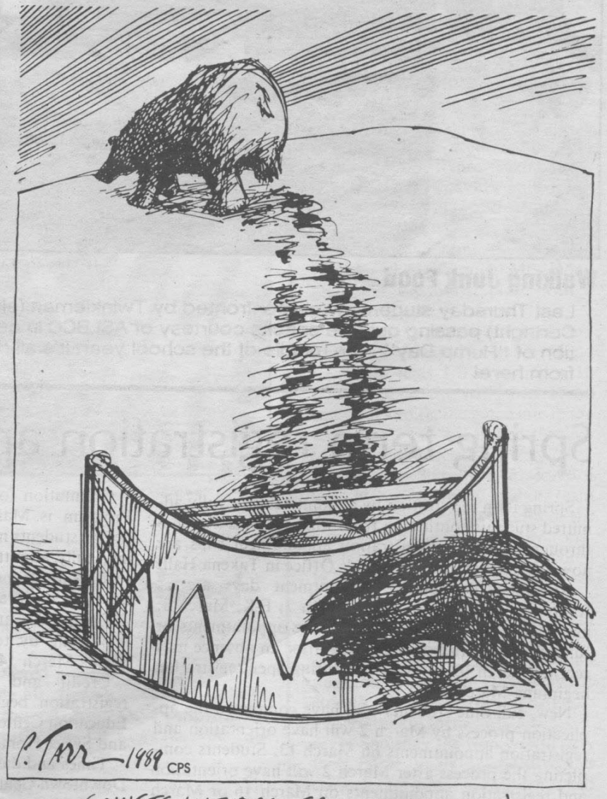
SOVIETS WITHDRAW FROM AFGHANISTAN

tasteless, we intend to weigh each future cartoon submission on its have received complaints about cer- merits, as we have in the past.