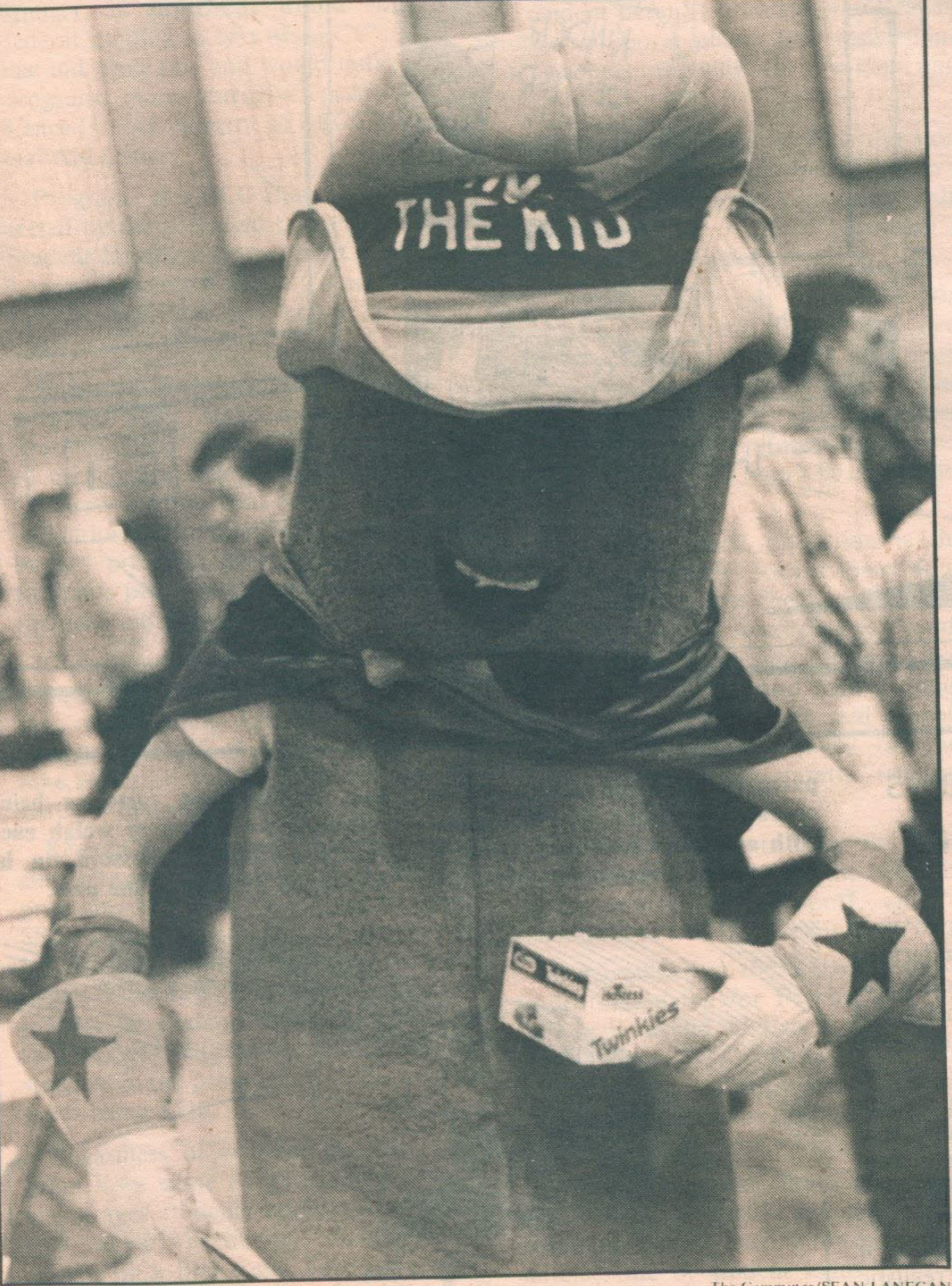
Walking Junk Food

The guests will be limited to two glasses of wine in accordance with the LBCC policy and other forms of non-alcoholic beverages will be served. The event will take place in May.