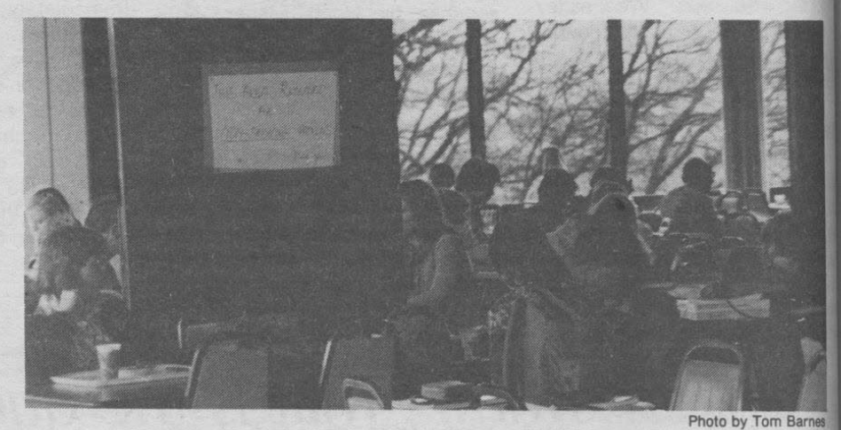
THE NON-SMOKING area in the LBCC Commons is often uncrowded, while the rest of the room is nearly filled.

Incidentally, it is interesting to note that the cigarette machine is located in the non-smoking area of the Commons.