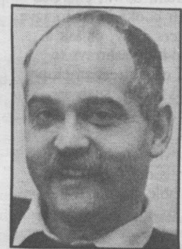
Valk, The Netherlands

another subject in another classroom before a different group, he said.