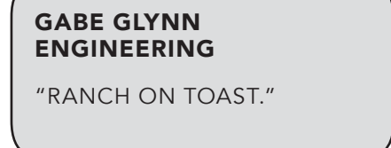
GABE GLYNN ENGINEERING