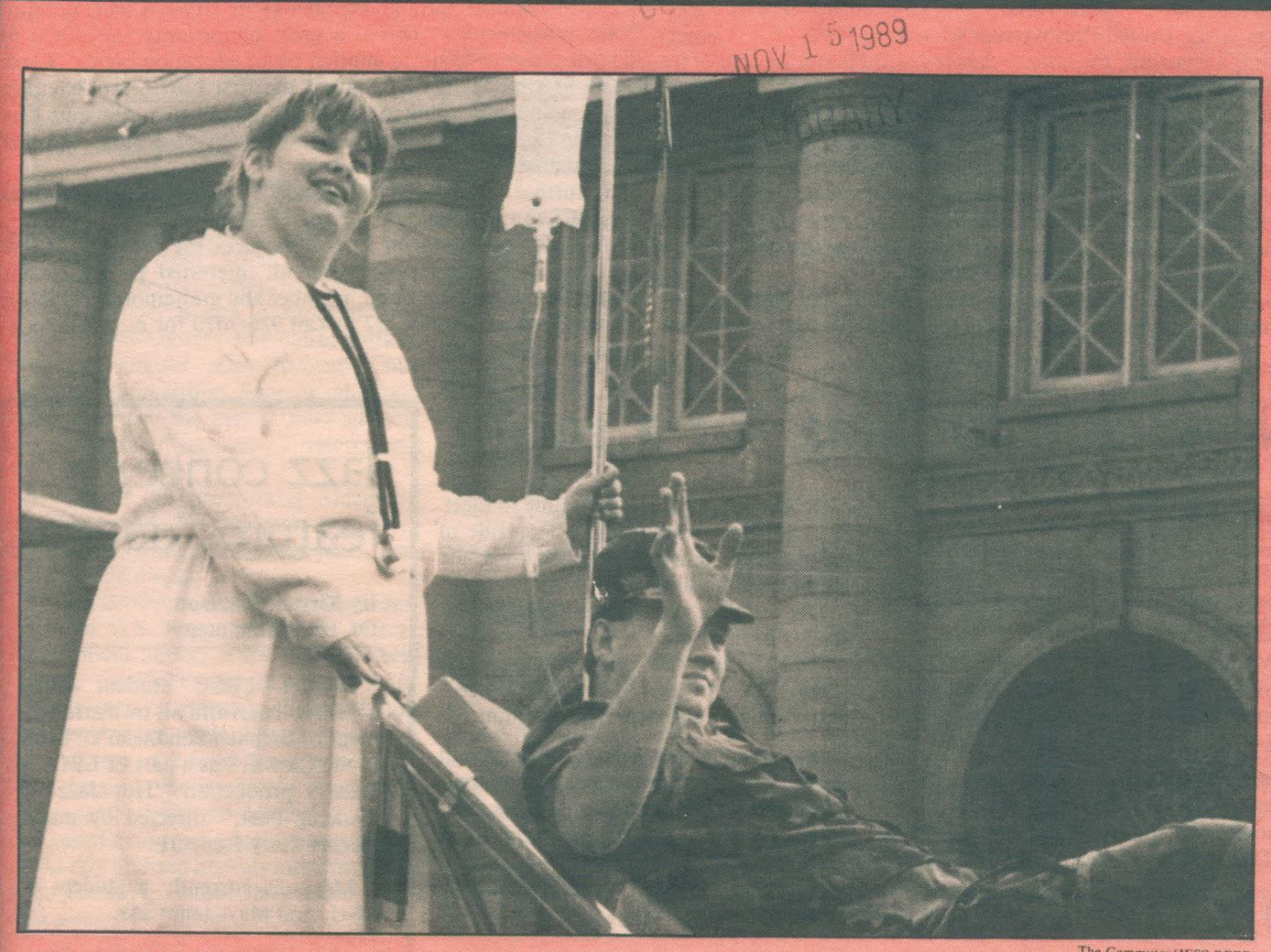
The Commuter/JESS REFD

VOLUME 21 • NUMBER 7 Wednesday, Nov. 15, 1989