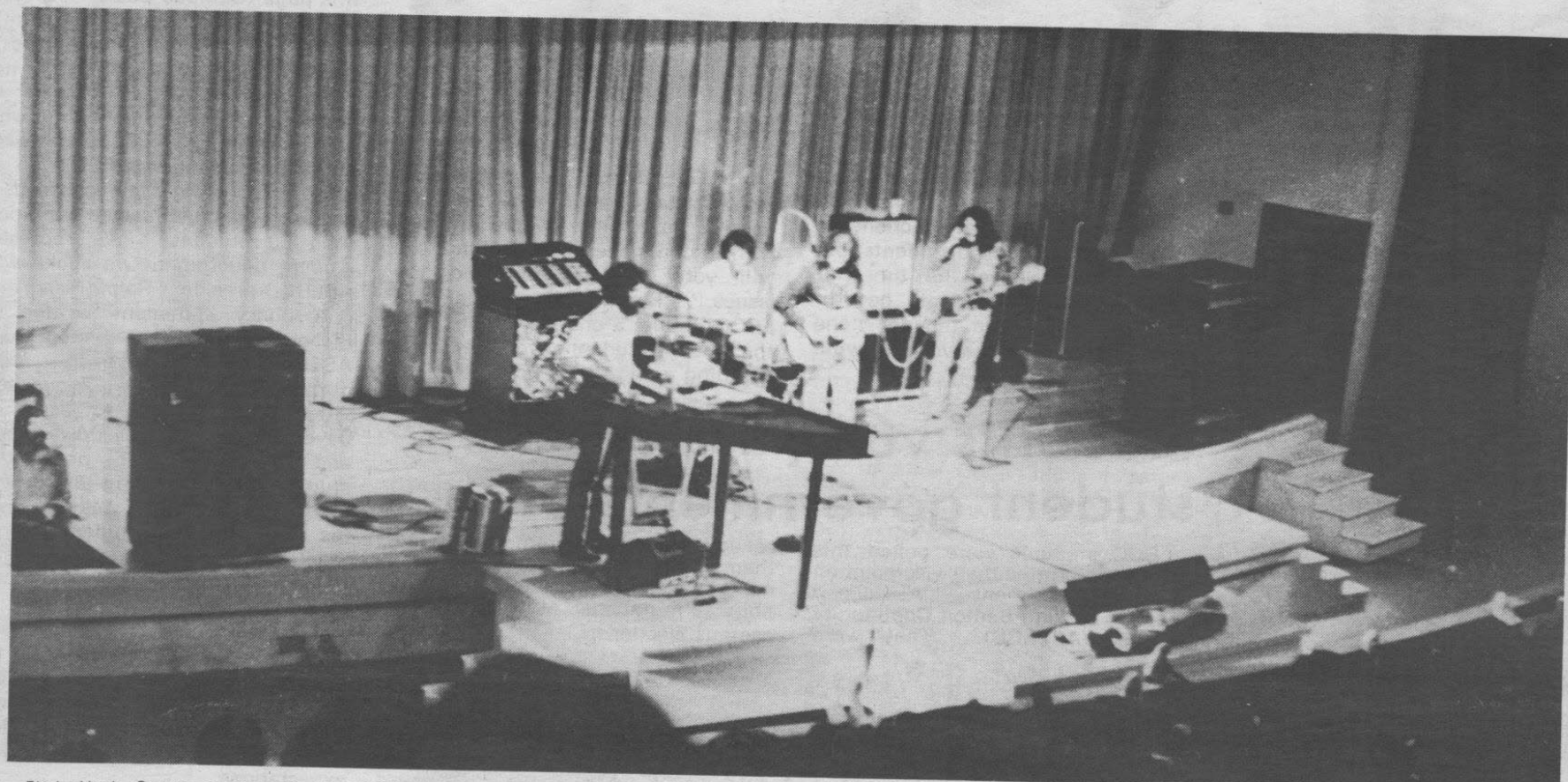
Black Hawk County on stage in the LBCC Forum at the dedication day Jammin' luncheon.

LINN-BENTON COMMUNITY COLLEGE ALBANY, OREGON VOLUME 6, NUMBER 2 • OCTOBER 25, 1974