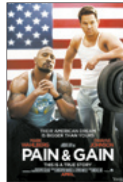
Pain & Gain Rated: R Genre: Thriller

Sources: IMDb, Yahoo! Movies, Fandango.com