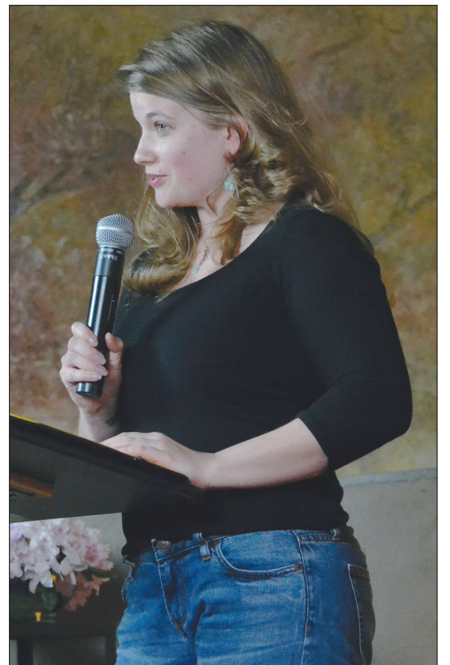
English Department faculty and friends presented "Spring Light: Readings and Other Delicacies" at the Benton Center Friday, April 19. The event was a benefit fundraiser for the LBCC English Scholarship/Program Endowment.