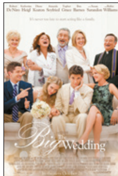
The Big Wedding Rated: R Genre: Comedy