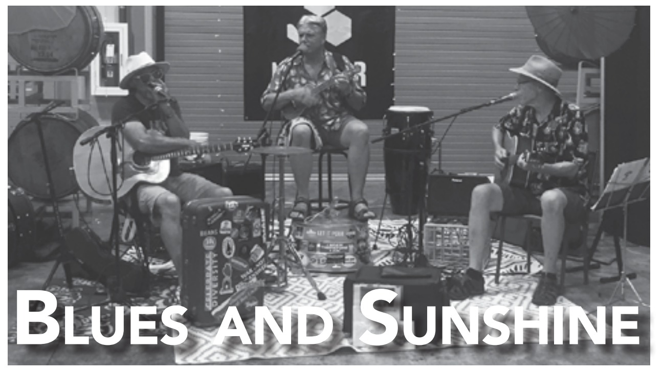
LBCC Benton Center Acoustic Showcase hosts "Blues and Sunshine" October 18