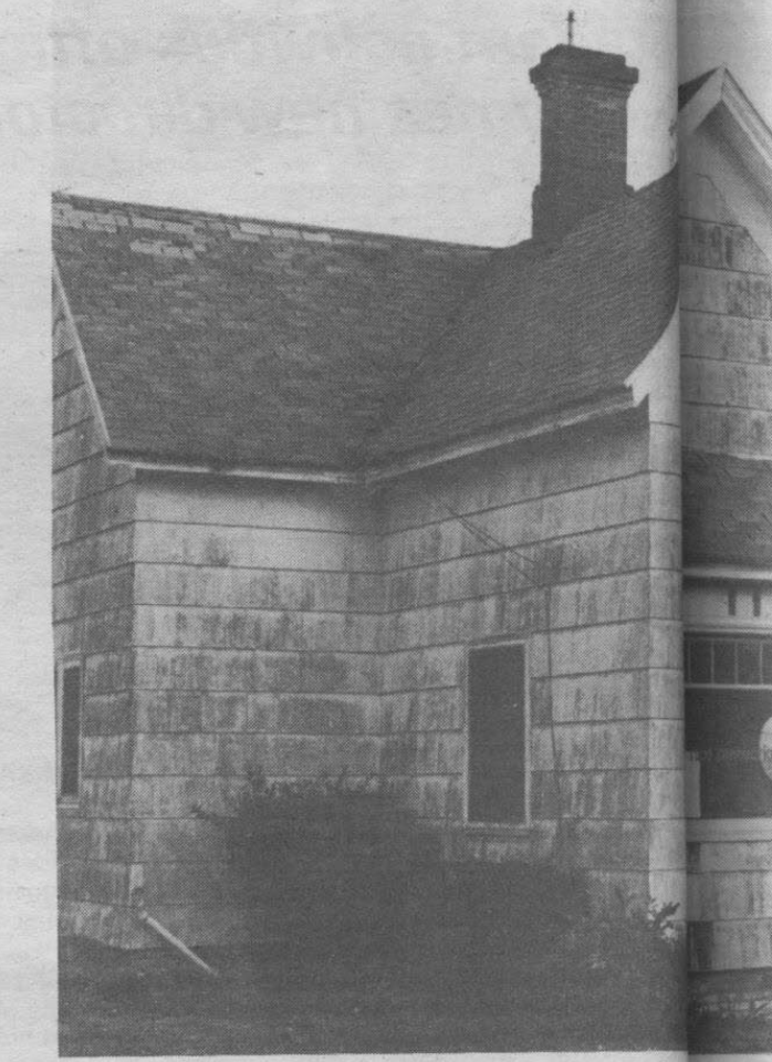
Food Connection 29 S.E. F

Story by Kathy Buschauer Photos by Julie Brudvig