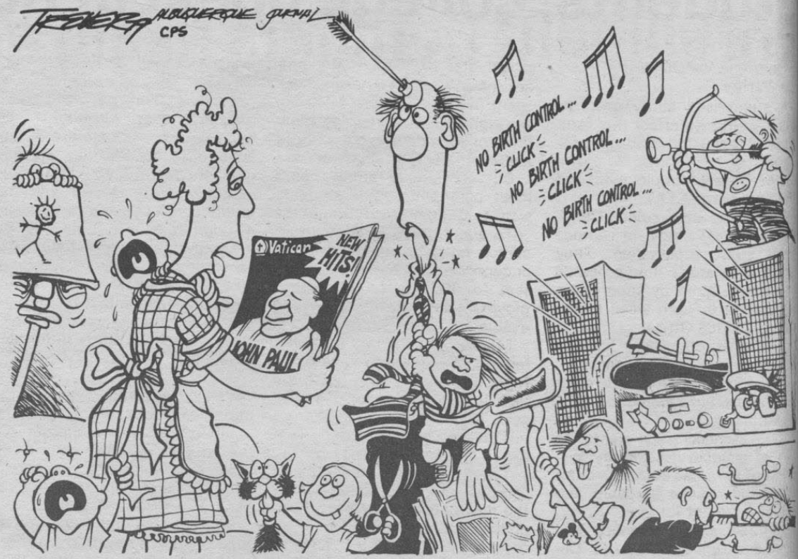
I JUST LOVE THE NEW COVER—BUT IT SOUNDS LIKE THE SAME OLD RECORD...."

Also discussed was a reciprocal agreement between Lane Community College and LBCC which would waive out-of-district tuition for LBCC students enrolling in programs which LBCC does not offer. Such programs include dental hygiene, flight technology and aquatic technology. It is similar to an agreement LBCC has with Chemeketa Community College, although the proposal would include an "open admission" policy.