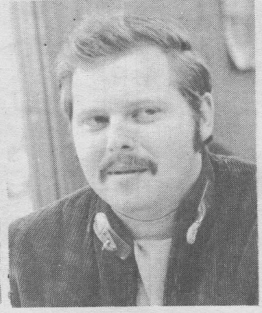
Hunt - "He Doug changed my mind, but not