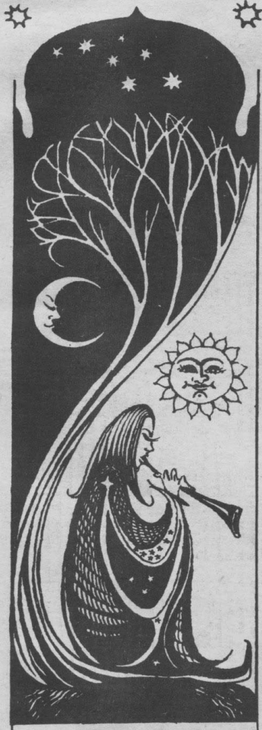
PLEIADES BOOK STORE 110 Ferry Street Albany 928-7197

lish more information as we recieve it. Be prepared to sign-up for one of these tournaments. Perhaps an LBCC student will go to the National Tournament.