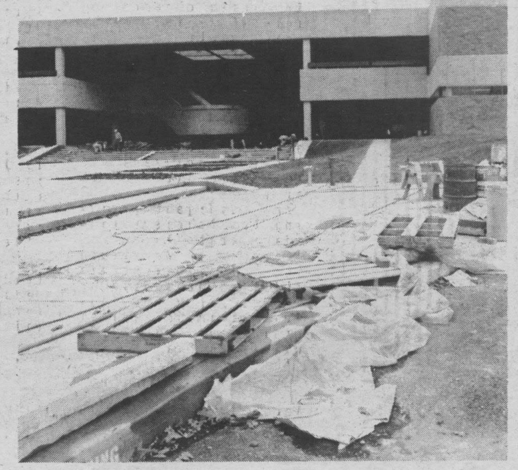
Action reporting! This mess was cleaned up within 24 hours after debris was captured on film.

"Red at night", may be a sailor's delight, but here on dry land at night, red posts in the middle of the walkway are not.