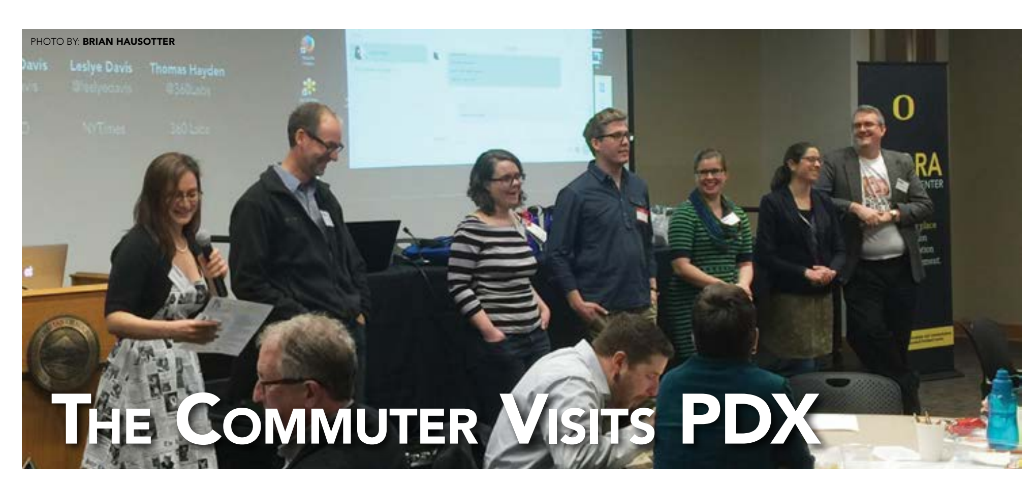
Commuter Staff visit journalism conference.

run newspaper, The Commuter, attended a journalism conference in Downtown Portland on Jan 23, hosted by the Society the SPJ Oregon Territory. of Professional Journalists.