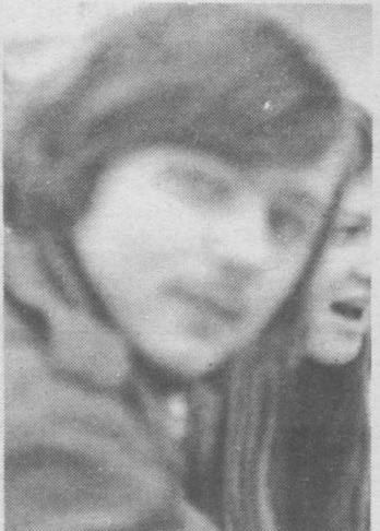
student body President, no. I think it needs to be restruc-