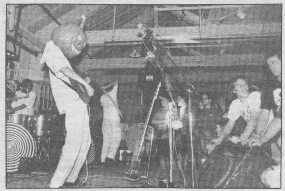
Hitting Birth (above) and Sweaty Nipples (below) dressed for the occasion at last Friday's concert at the Mission Mill in Salem.

The Nipples joined in on the fun with the very best costumes. One bassist donned a baboon mask flanked by streamers, feathers and ribbons. His body was covered by flowing textures of color like some sort of tribal