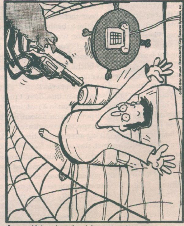
"... and let me just dispel the myth right now pal, I am NOT more frightened of you than you are of me."

we were all set to show our visitors our Chritrees and Yuletide decorations. The lights we come on.