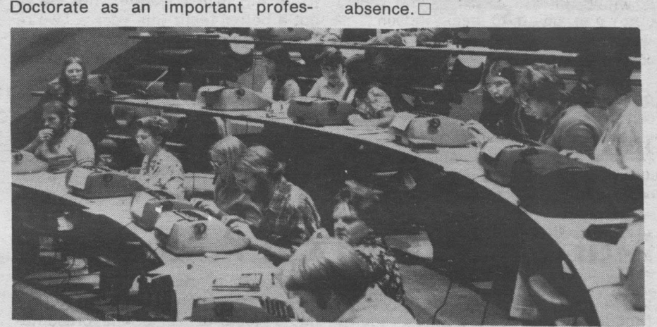
Students typing their news articles during ten minute writing periods at LBCC's reporting exercise.