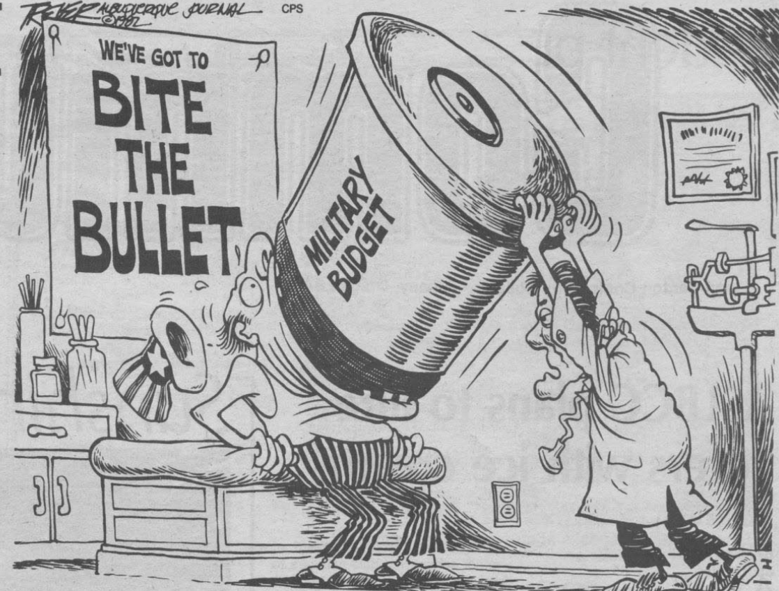
"STOP COMPLAINING AND SWALLOW- THIS IS FOR YOUR OWN GOOD!"

can once again belong to the people. Protect your freedom and right to a future. Let our leaders know this country isn't made up of a faceless "silent majority." Be vocal, make your demands known. Show your support—help stop the abuse of nuclear power.