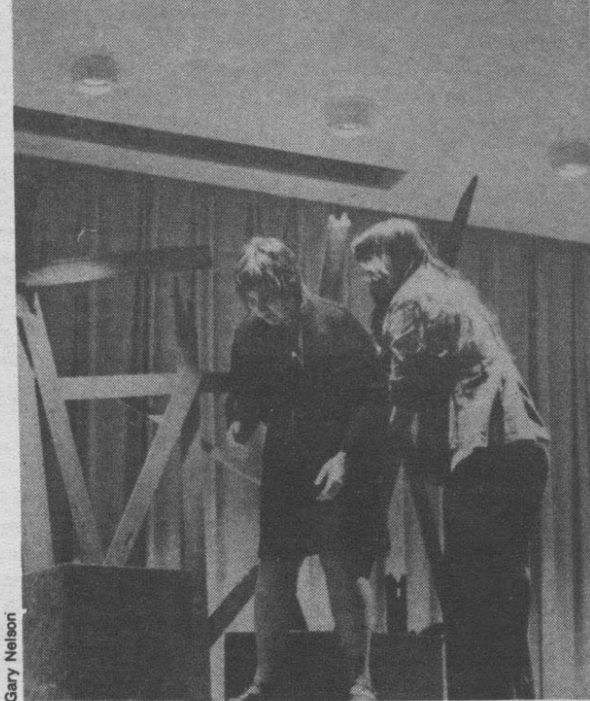
How does one portray a drunk and a nun making candles in a tree? For a dubious answer, see below.

The rules are the same for drama or comedy no matter what the setting: