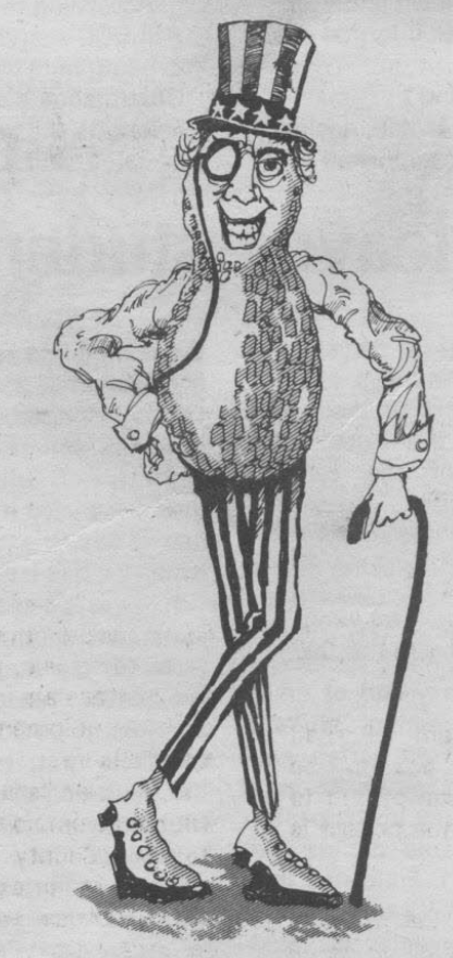
THE JIMMY CARTER UNCLE SAM

COMMUTER VOLUME 8 NUMBER 9 • DECEMBER 1, 1976