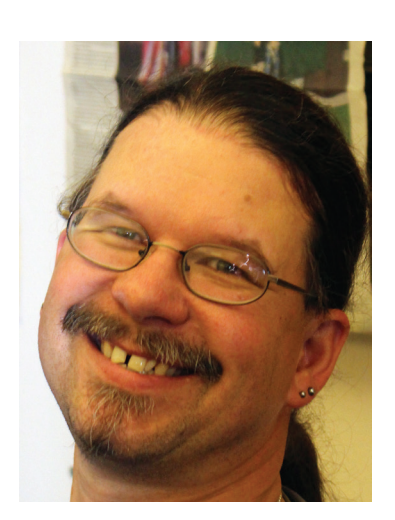
COLUMN BY DALE HUMMEL

The meaning of social justice is quite clear in dictionary.com: it is "the distribution of advantages and disadvantages within a society." In a world of pixie dust and rainbows this theory may be ideal, but in real world applications this is anything but ideal. In fact, it is nearly considered theft from those who have earned an award or level of achievement.