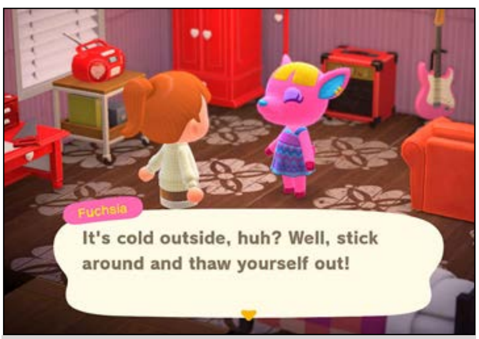
'ANIMAL CROSSING NEW HORIZONS'

With the game having sold a record 13 million copies to date, "Animal Crossing New Horizons" is the definitive "Animal Crossing" experience. It's another "must-own" game for the Switch and the ideal tropical escape in a time where people need it the most.