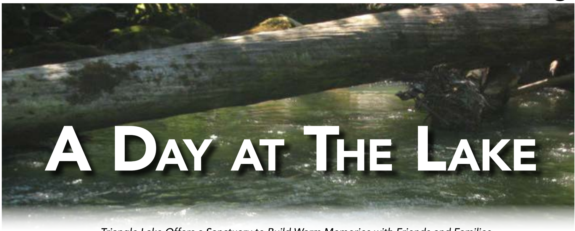
Triangle Lake Offers a Sanctuary to Build Warm Memories with Friends and Families