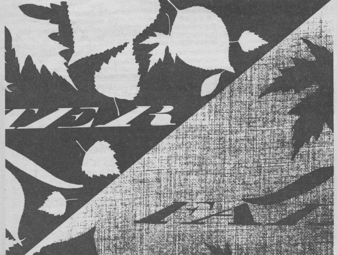
Photogram by Cheryl Nicklous